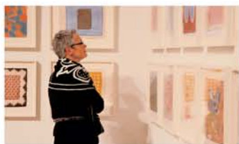
Visitor with work by Louise Bourgeois, Ode a L'Oubli , 2004

Our curators create thoughtful exhibitions that give viewers an opportunity to experience and learn from a variety of artistic approaches, periods, and ideas.