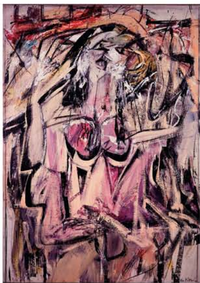
Willem de Kooning, Woman , 1949-50

The Weatherspoon's collections span from the beginning of the twentieth century to the ever-changing present. Among the holdings are important works by modern masters such as Willem de Kooning, David Smith, Eva Hesse, Robert Rauschenberg, Andy Warhol, and Elizabeth Murray, as well as works by emerging artists who are shaping the world of contemporary art. The Weatherspoon regularly lends artworks from its collection to other museums both national and international.