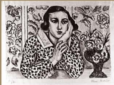
Henri Matisse, Jeune fille accoudée au paravent fleuri (Young woman leaning on elbows before flowered screen), 1923

The Weatherspoon Art Museum, part of The University of North Carolina at Greensboro, offers rich cultural experiences for diverse audiences from the campus, community, region,