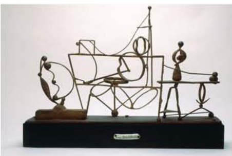
David Smith, Interior , 1937