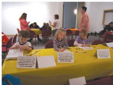
Children enjoying art activities at Family Day