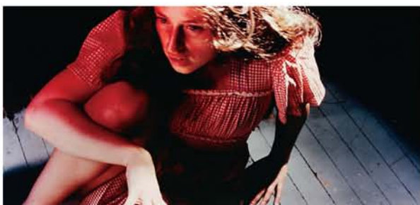
Cindy Sherman, Untitled #85 , 1981

The Contemporary Collectors Group (CCG) is a special interest group open to all museum members. They enjoy invitation-only events, talks by artists, critics, and other collectors, exhibition previews, and travel opportunities to visit museums, galleries, private collections, and art fairs. Annual membership is $75 per person. For more information, please call the Museum Administrator at 336.334.5770.