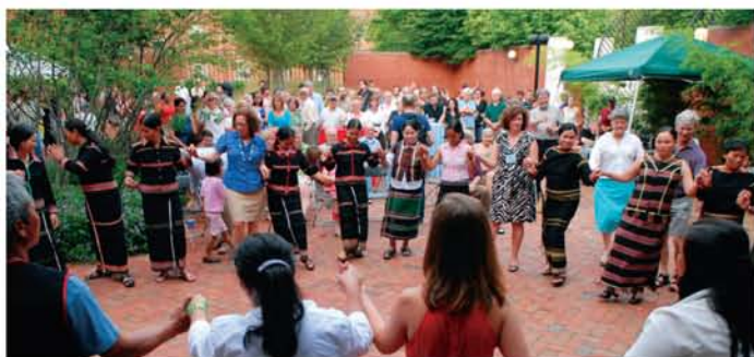
Summer Solstice Party

free or for a nominal fee to make them available to the broadest possible audiences. Over 3,000 students participate each year free guided tours, and teachers benefit from hands-on workshops and professional development opportunities. New technologies such as cell-phone tours and an online database of the permanent collection are further extending the Museum's audience.