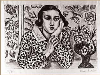
Henri Matisse, Jeune fille accoudée au paravent fleuri (Young woman leaning on elbows before flowered screen), 1923

The Weatherspoon Art Museum, part of The University of North Carolina at Greensboro, offers rich cultural experiences for diverse audiences from the campus, community, region, and beyond.