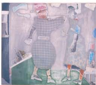
Romare Bearden, Conversation Piece , 1969

The Weatherspoon's education department offers a wide range of lectures, films, artist talks, docent-led tours, family events, and outreach programs for both the university and the larger community. Most are offered