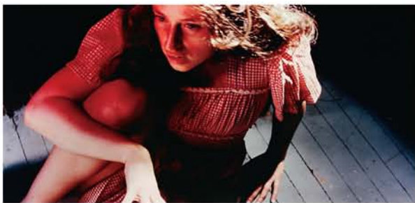
Cindy Sherman, Untitled #85 , 1981

The Contemporary Collectors Group (CCG) is a special interest group open to all museum members. They enjoy invitation-only events, talks by artists, critics, and other collectors, exhibition previews, and travel opportunities to visit museums, galleries, private collections, and art fairs. Annual membership is $75 per person. For more information, please call the Museum Administrator at 336.334.5770.