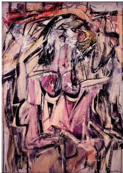
Willem de Kooning, Woman , 1949-50

The Weatherspoon's collections span from the beginning of the twentieth century to the ever-changing present. Among the holdings are important works by modern masters such as Willem de Kooning, David Smith, Eva Hesse, Robert Rauschenberg, Andy Warhol, and Elizabeth Murray, as well as works by emerging artists who are shaping the world of contemporary art. The Weatherspoon regularly lends artworks from its collection to other museums both national and international.